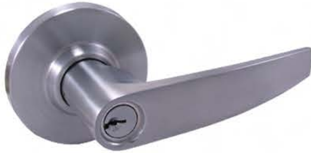
Half Curve Lever