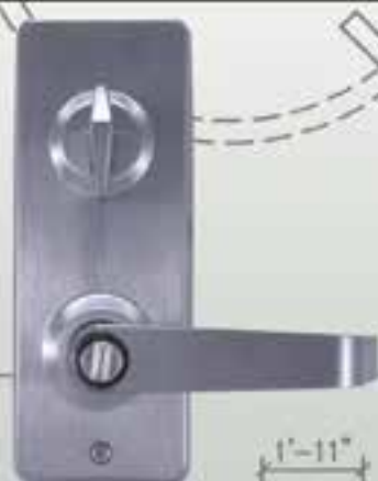
Inside View of Escutcheon