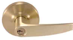
Half Curve Lever

Stocked in US26D Lever Kits for other finishes