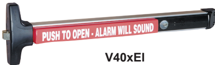
V40xEI (Shown with mortise cylinder - sold separately)

The Electric Integration device, designed for applications where electric integration is required, provides the customer with a means of integration to new or existing systems, including the Detex Series 800 Logic Controller. The customer may select from these components to integrate and create different functions from the single product package. This variety of components offers an alarm to sound, monitor the latch bolt position and/or pushpad when depressed, signals a remote panel by key switch operation when activated from inside or outside authorization, and offers 2 LED's to enhance required functions. The operation of switches will open or close (SPDT) to integrate with digital video recorders, remote alarms, strobe lights, or commence the cycle in a separate delayed egress system.