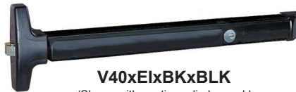
V40xEIxBKxBLK (Shown with mortise cylinder - sold separately)