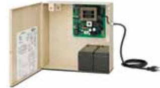
632RF x PC x CR4 x 2 RB12V4