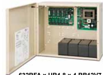
632RFA x UR4-8 x 4 RB12V7