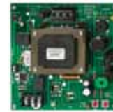
632RFL Less Cabinet