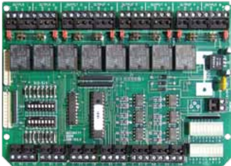
UR2-4 / UR4-8 Access Hardware Controller

The UR4-8 is capable of providing the logic of 8 relays.