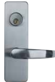
08D shown Also available on 02D, 02DM, 02DN, 02DNV, 02DV, 08DM, 08DN, 08DNV, 08DV, 09D, 09DM, 09DN, 09DNV, 09DV, 14D, 14DM, 14DN, 14DNV, 14DV, EU, EU2W, EUV, EUxDM