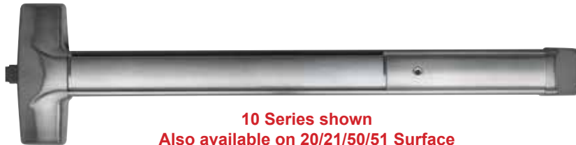
10 Series shown Also available on 20/21/50/51 Surface Vertical Rods, 30 Mortise, 40 Rim, and 60/61/62/63/70/71/80/81/82/83 Concealed Vertical Rods